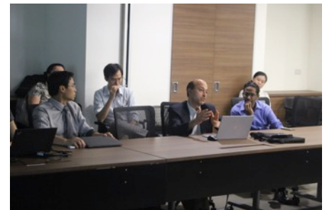
MDT discussion with the faculties