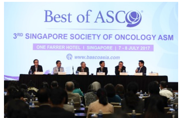
Panel Discussion - Exchanging of ideas