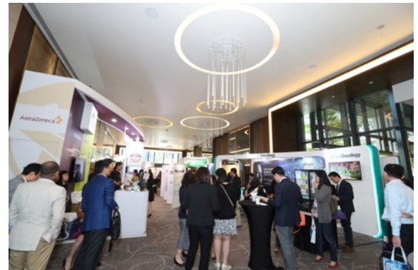
Exhibition in Best of ASCO 2017