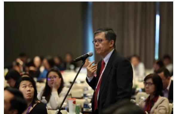
Questions and answers time