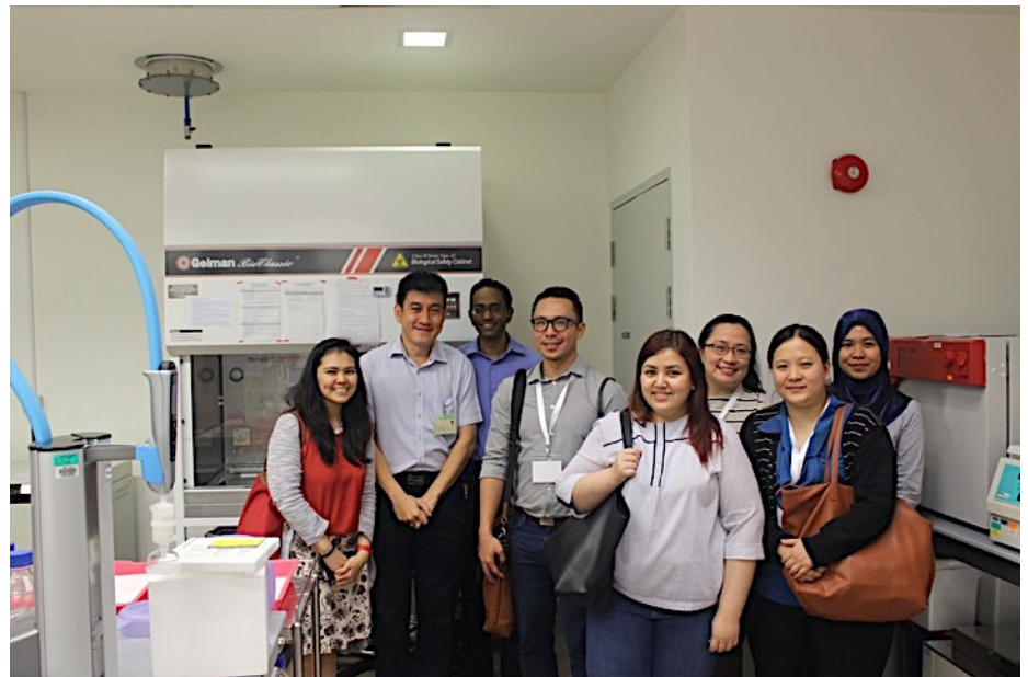
Participants visited the Polaris Laboratory located at Singhealth Academia